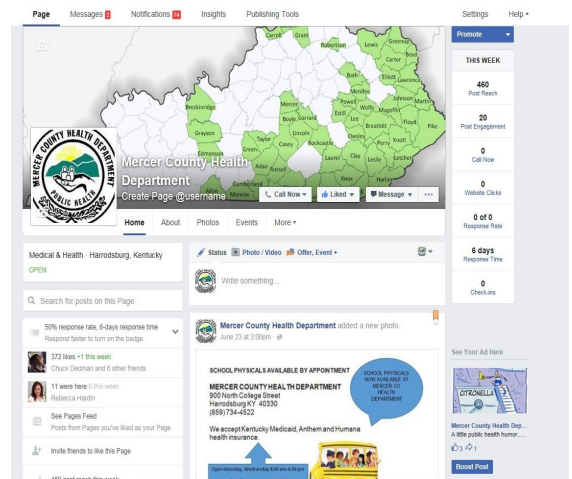
Mercer County Health Department’s Facebook Page